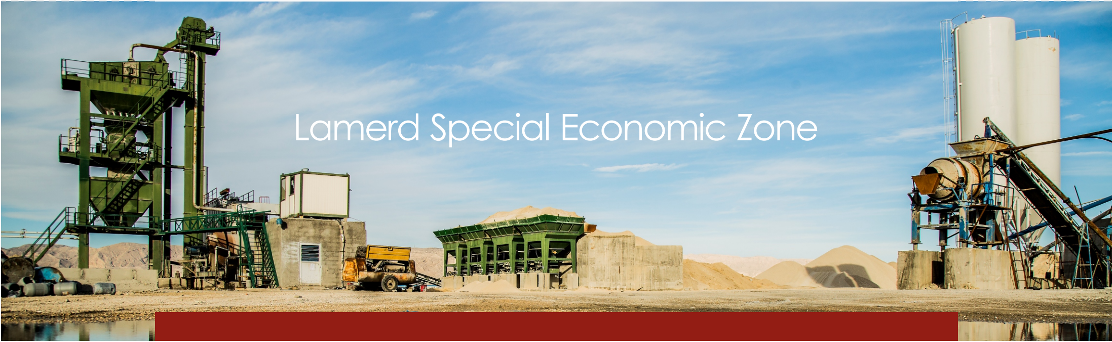
Lamerd Special Economic Zone