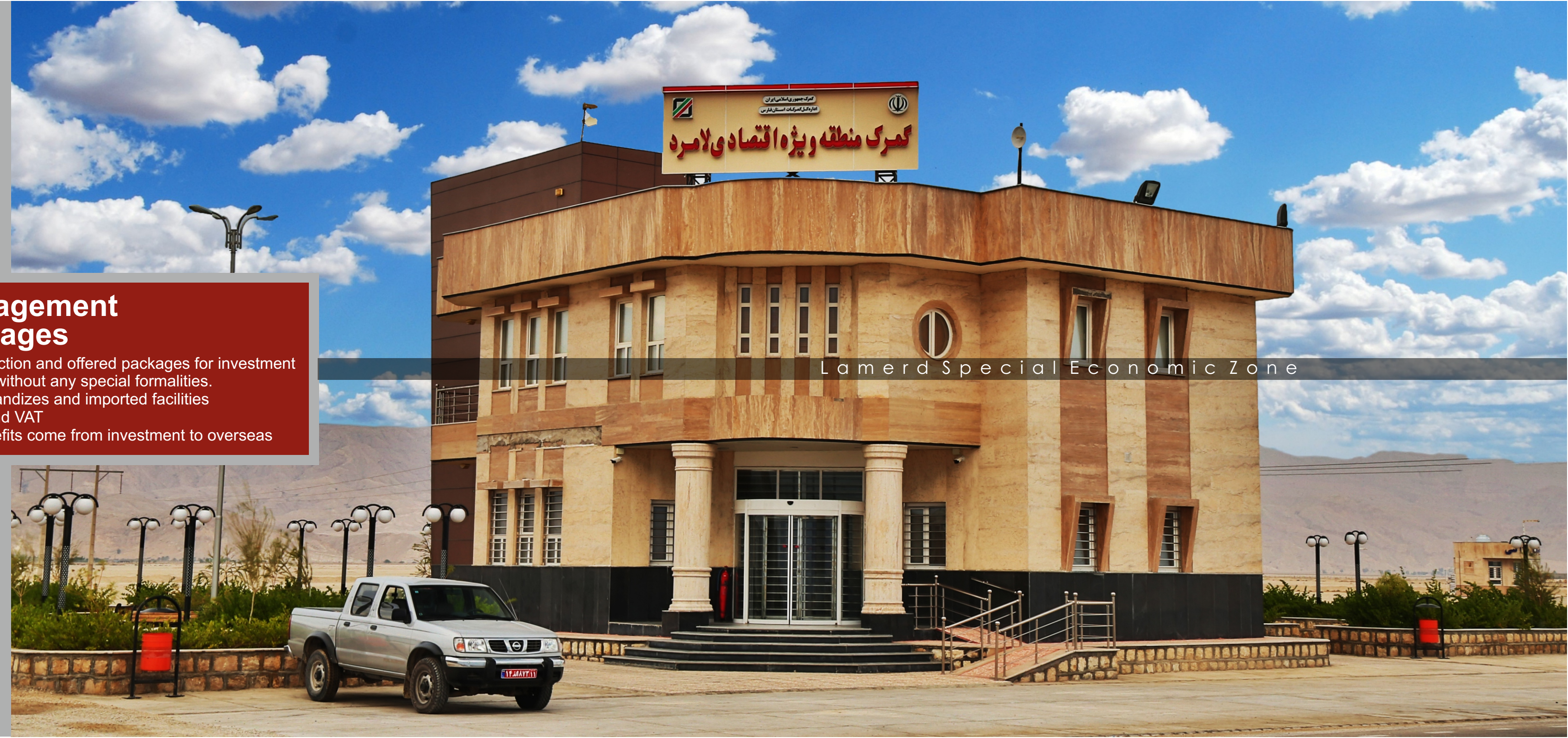
Lamerd Special Economic Zone

Readiness of Infrastructure for construction and offered packages for investment Allowed trading with foreign countries without any special formalities. Exemption of custom duties for merchandizes and imported facilities Exemption of tax and custom duties and VAT Lack of barrier of transferring the benefits come from investment to overseas